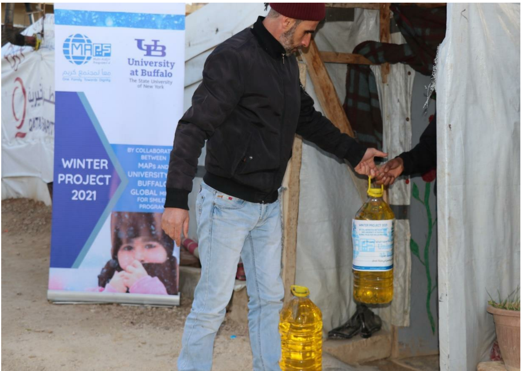
Lebanon resident receives heating oil as part of UBGMS Winter Project, almost 2400 families were helped.